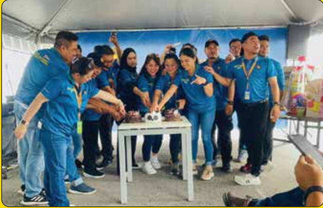
Birthday Babies (Closing Ceremony)